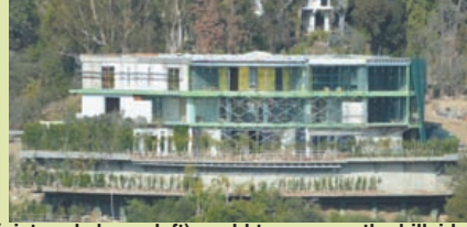
The proposed property at 1184 Loma Linda Dr. (pictured above, left) could tower over the hillside of Beverly Hills in the same way the controversial 901 Strada Vecchia (above, right) has threatened to do in Bel-Air.